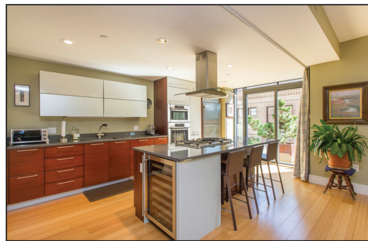
The sleek kitchen open to the dining/living room includes a center island with a gas range and wine fridge, custom cabinetry and high-end appliances.

ing provide an incomparable setting for displaying art, as intended. The kitchen itself could be considered a work of art with its central island, custom cabinetry, paneled dishwasher, Sub-Zero refrigerator, Miele double oven and Zephyr hood.