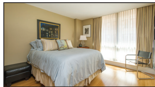
The second bedroom has an en suite bath and a double closet with built-in shelving and hanging rods.

baths, one with a Bain Ultra jetted tub and the other with an oversized walk-in shower and bench. Each room has a double closet with built-in shelving and racks.