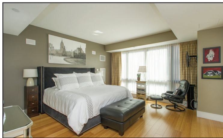
The master bedroom has floor-to-ceiling windows and a luxurious en suite bath with a walk-in shower.