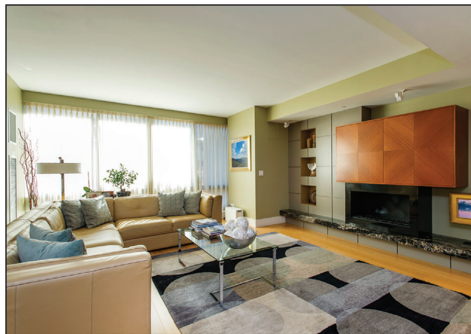
A custom-designed duplex at 45 Province in Midtown, the only duplex in the building, has three en suite bedrooms and a balcony. It is listed at $3.299 million.