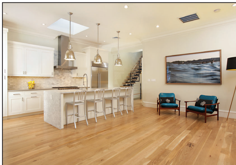
A Back Bay penthouse at 105 Marlborough St. is undergoing a total renovation and will include two bedrooms, two baths and a private roof deck. It is listed at $2.3 million.

Now 144 years later, in the spirit of Kirby, Boston architect Steven Young has purchased the property's top-floor