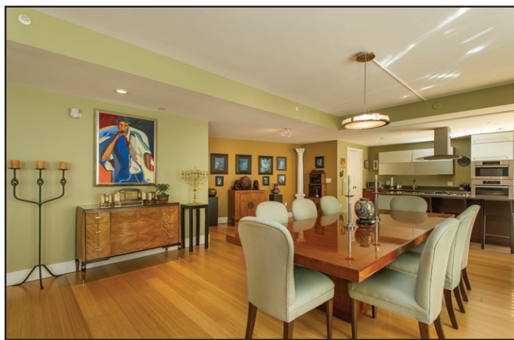
The dining area, situated between the kitchen and the fireplaced living room, is spacious and has access to a long balcony.

The open plan of the main level lends itself well to the owners' Art Deco furniture, while its flexible, contemporary flow can complement styles from various periods. The long, uninterrupted walls and gallery-quality light-